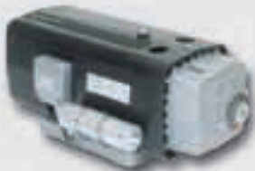
Seco Model SV1040