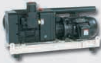
Mink Pressure or Vacuum