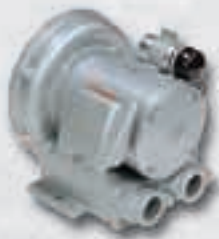
Samos Regenerative Blower