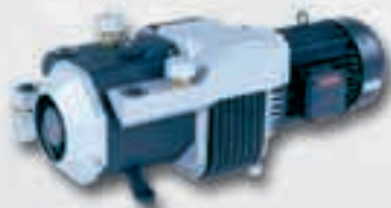
Seco Print for Vacuum and Pressure