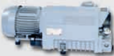
R5 Rotary Vane Vacuum