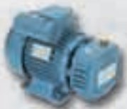
Seco Model SV1004