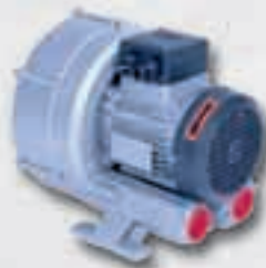
Samos 2-Stage Regenerative Blower