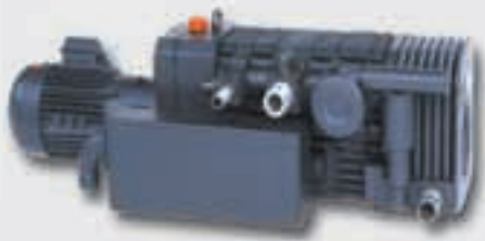
Merlin Combination Pressure/Vacuum Pump