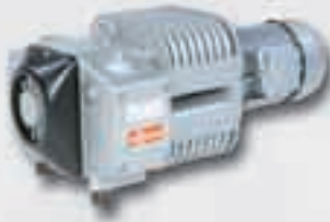
Seco Model SV1063